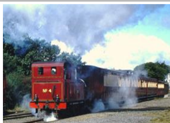
IOMSR No4 Loch @ Port Erin