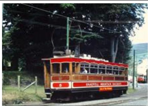
Snaefell No5 @ Laxey